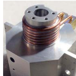
Aremco-Bond™ 568 bonds copper heat exchange tube to aluminum.