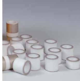
Pyro-Duct™ 597-C metallizes ceramic tubes.