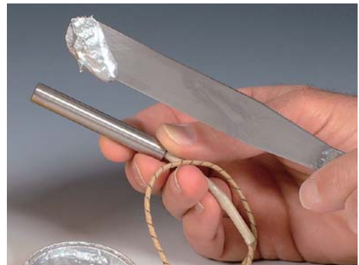
Heat-Away™ 639 coats process heater to improve thermal contact.