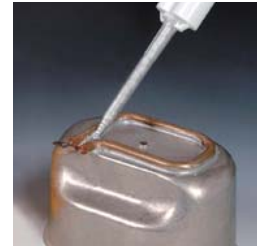
Aremco-Bond™ 568 bonds copper tube heater to reservoir.